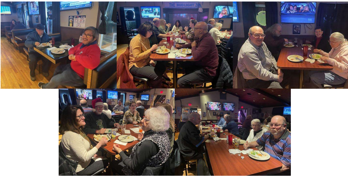
Above Photos: Pictures from the Council Christmas Party at MicGinny's on 12/18/2023